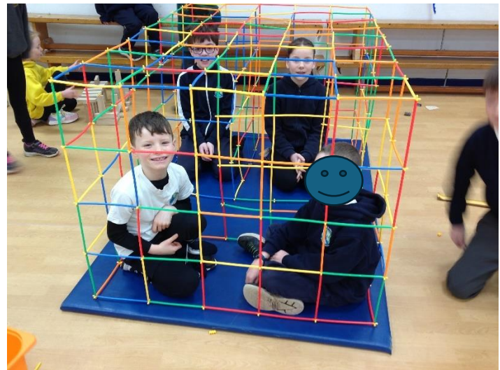
Experimenting with structures at Sunrise Club

Please contact extendedday@sunhill-jun.hants.sch.uk regarding booking. All children aged 4-11 are welcome to attend!